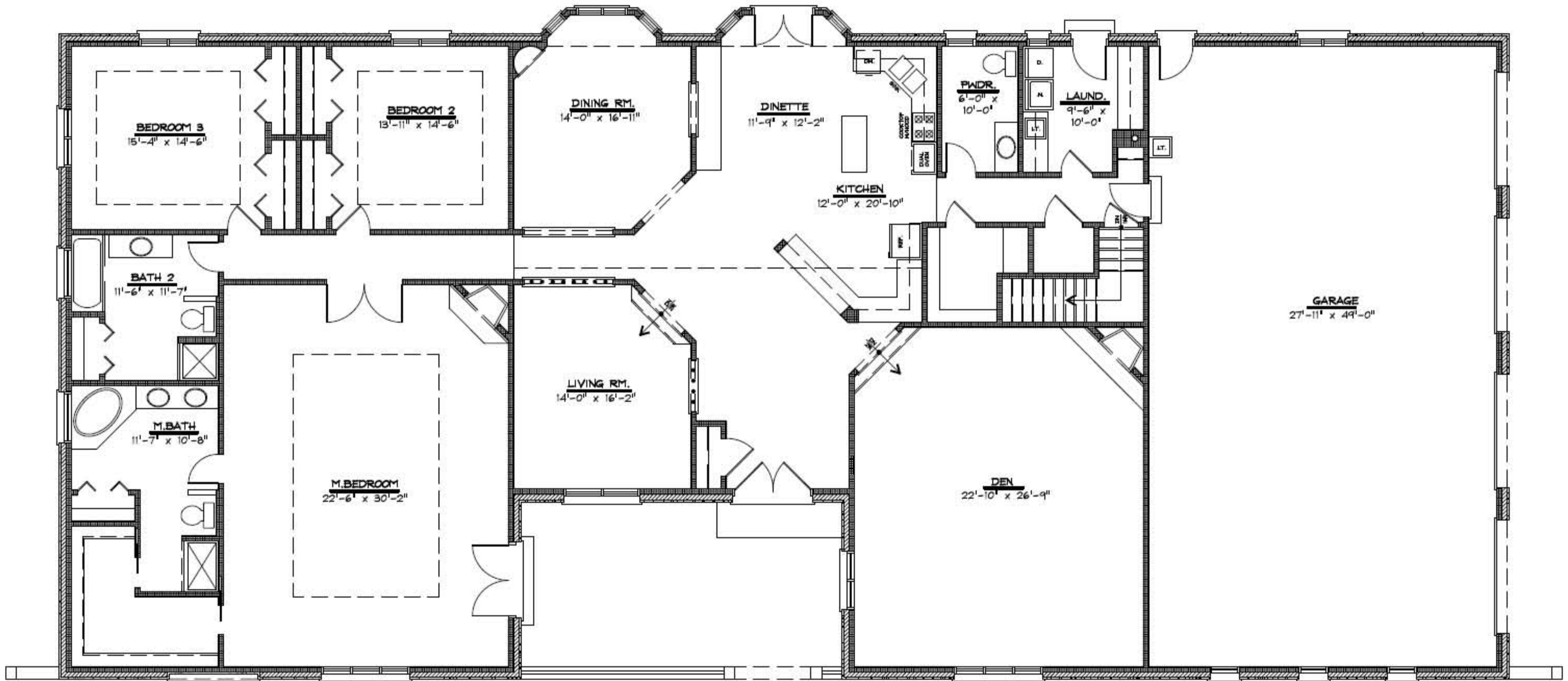
FIRST FLOOR PLAN 4132 S.F. ADAIR ARCHITECTS PLAN # 0017