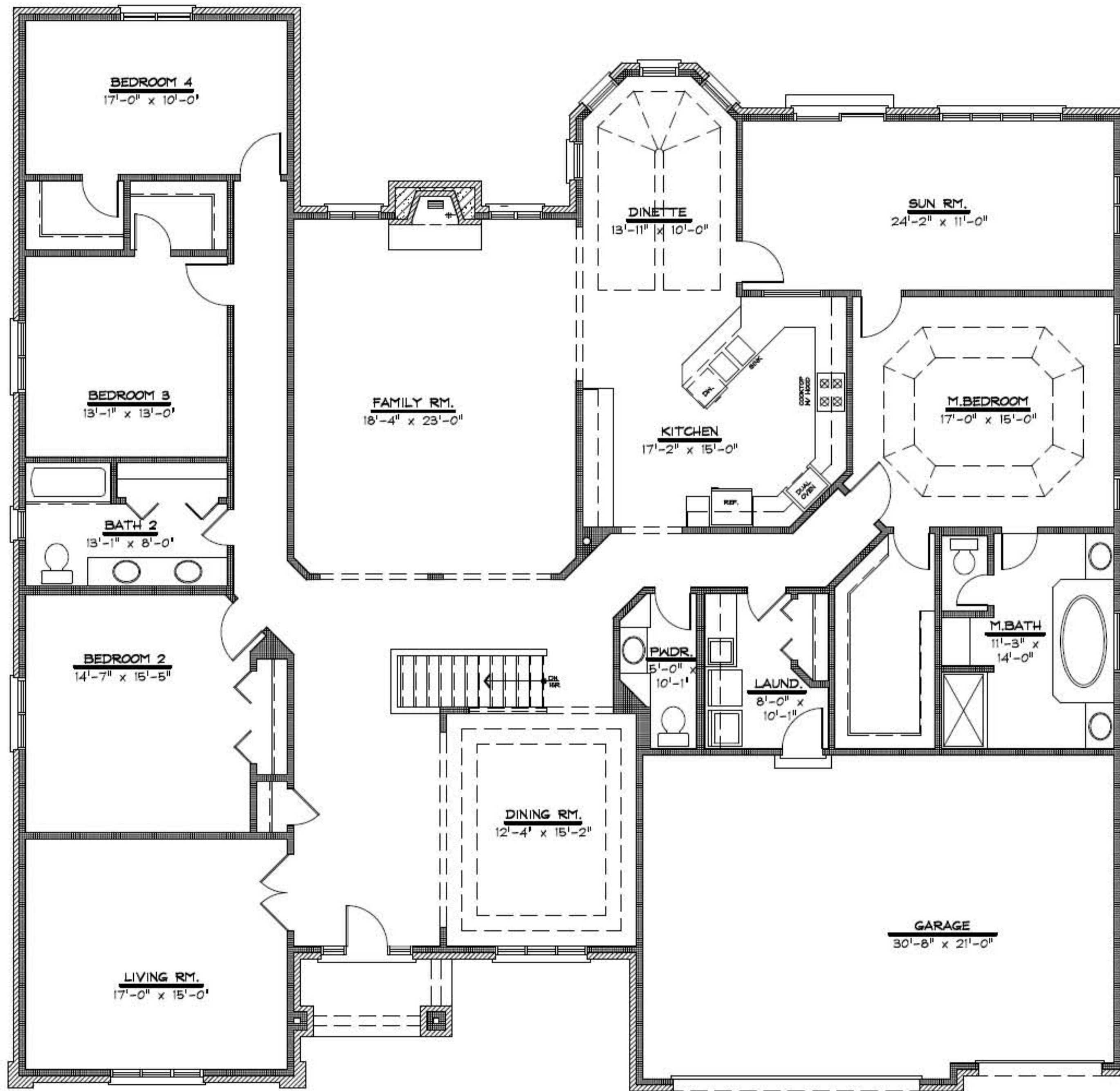
FIRST FLOOR PLAN 3769 S.F. ADAIR ARCHITECTS PLAN # 0023-1