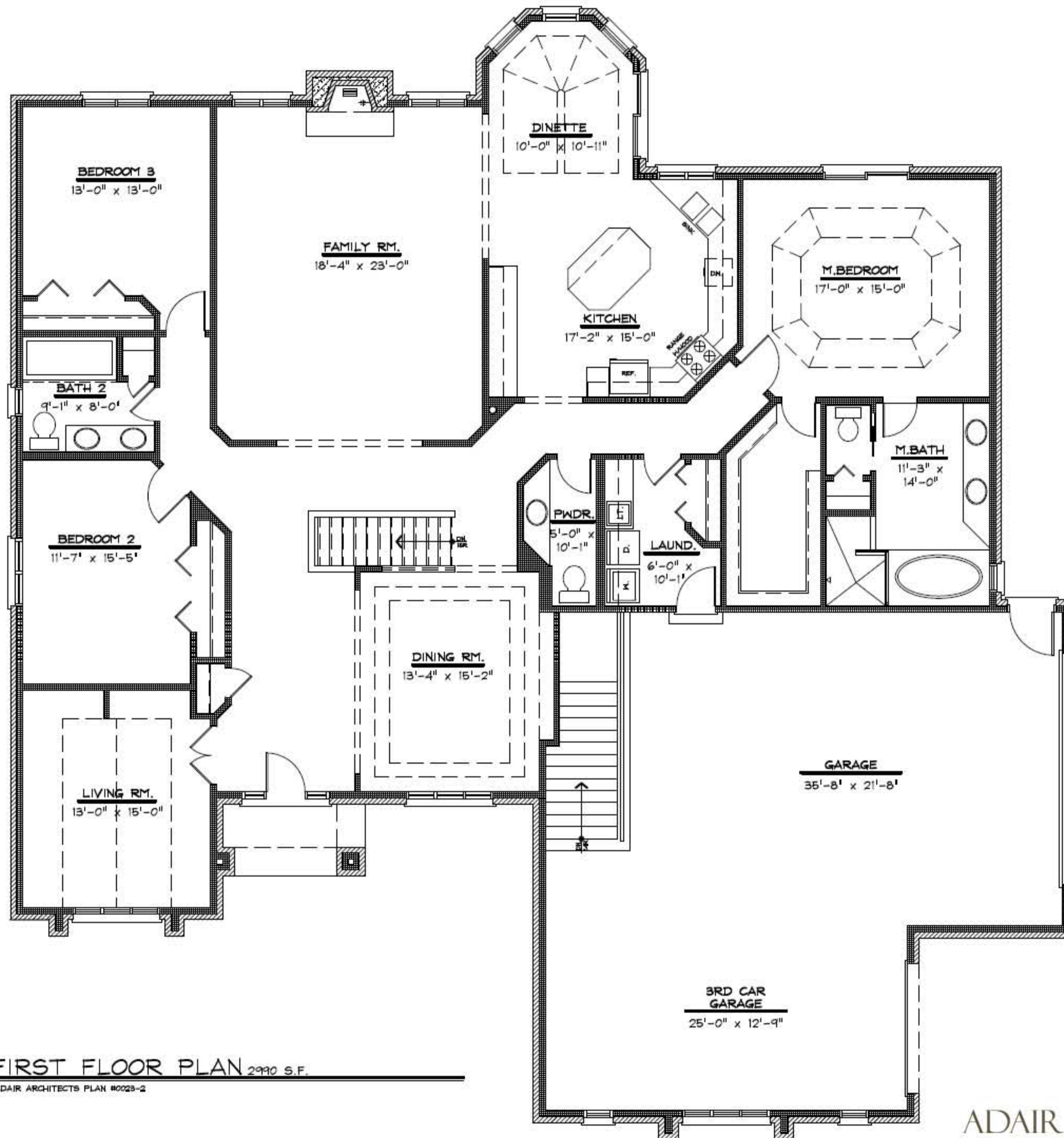
FIRST FLOOR PLAN 2990 S.F. ADAIR ARCHITECTS PLAN #0023-2