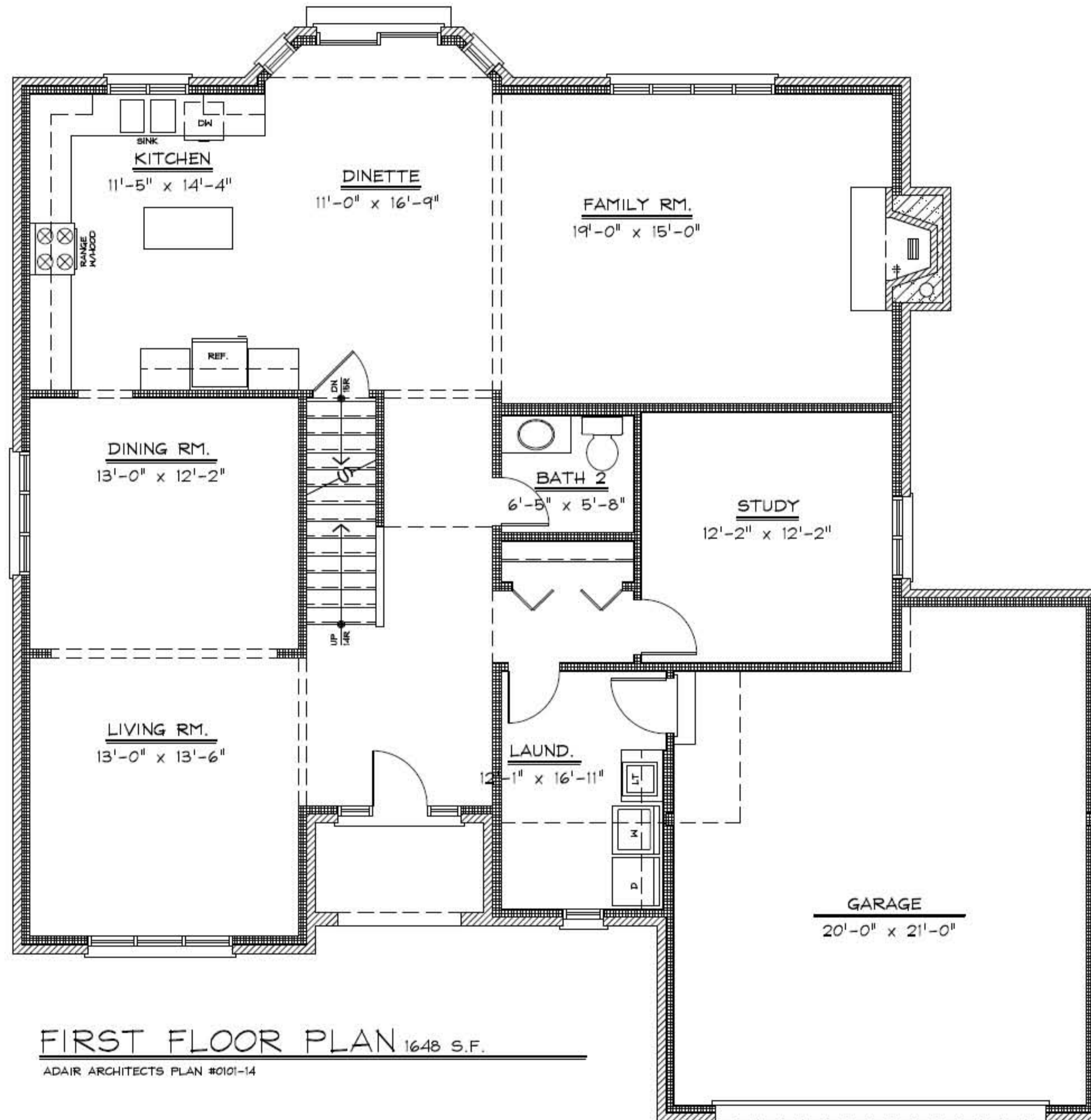
FIRST FLOOR PLAN 1648 S.F. ADAIR ARCHITECTS PLAN #0101-14