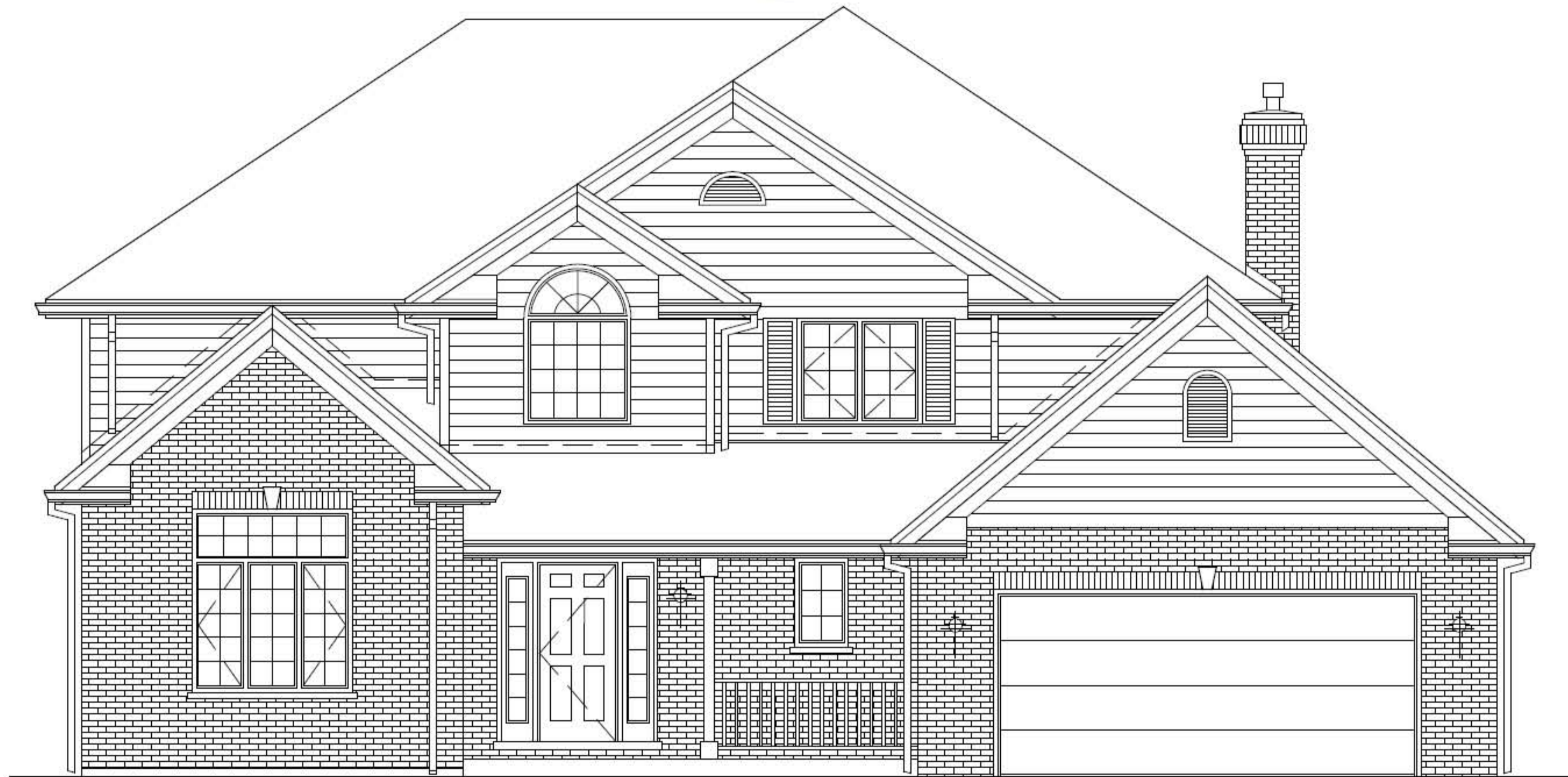
FRONT ELEVATION 2786 S.F.

19150 Wolf Rd, Suite A, Mokena, IL 60448-1081 (708) 478-7160