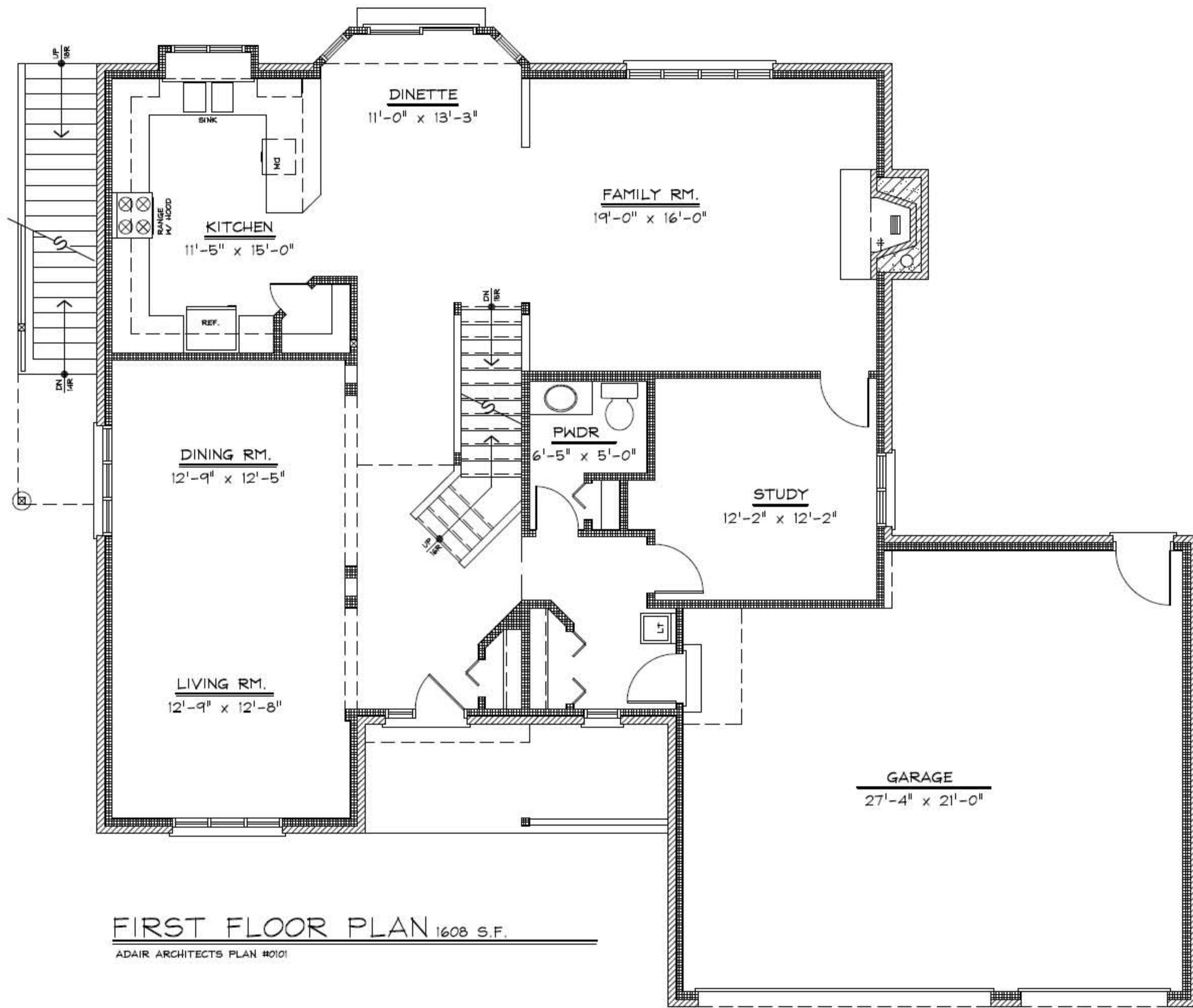
FIRST FLOOR PLAN 1608 S.F. ADAIR ARCHITECTS PLAN #0101