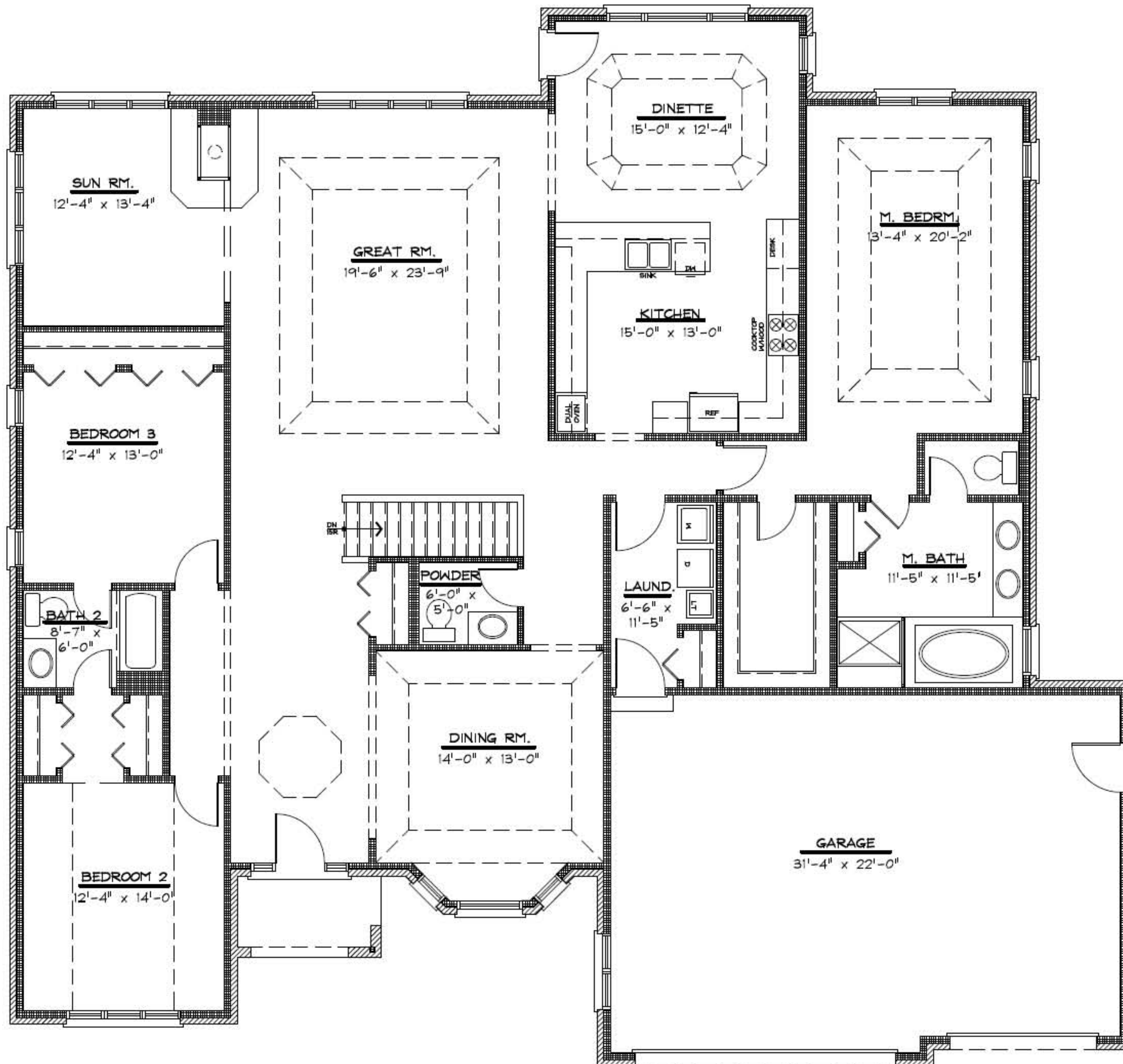
FIRST FLOOR PLAN 2975 S.F. ADAIR ARCHITECTS PLAN #0416