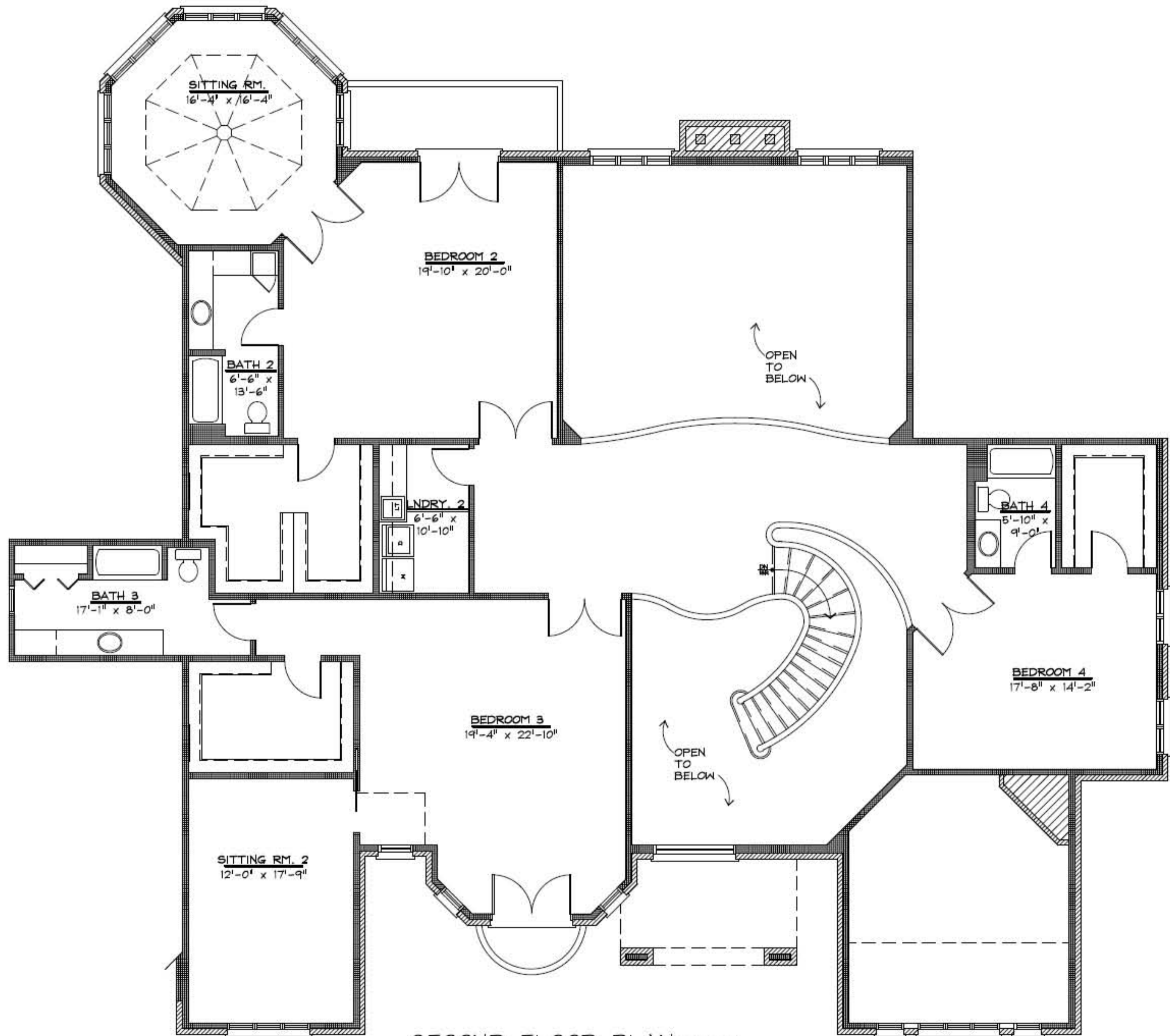
SECOND FLOOR PLAN 2486 S.F.