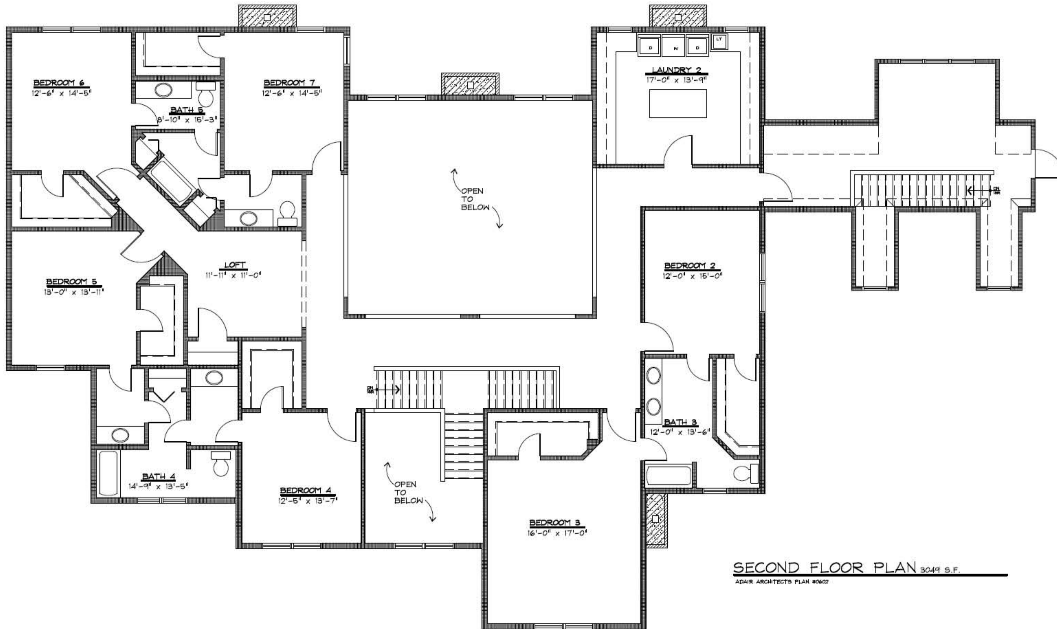
SECOND FLOOR PLAN 3049 S.F. ADAIR ARCHITECTS PLAN #0602