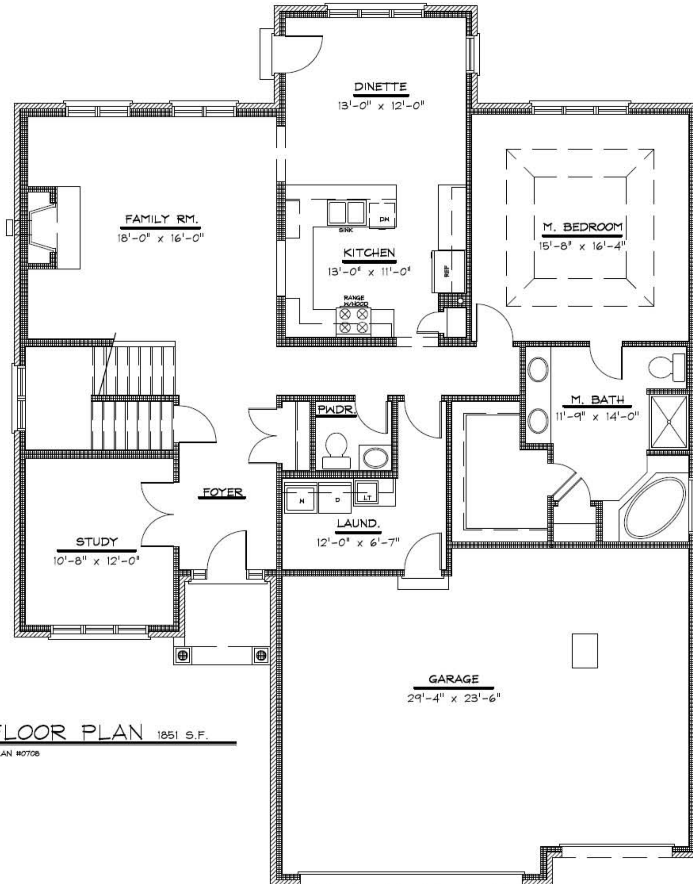
FIRST FLOOR PLAN 1851 S.F. ADAIR ARCHITECTS PLAN #0708