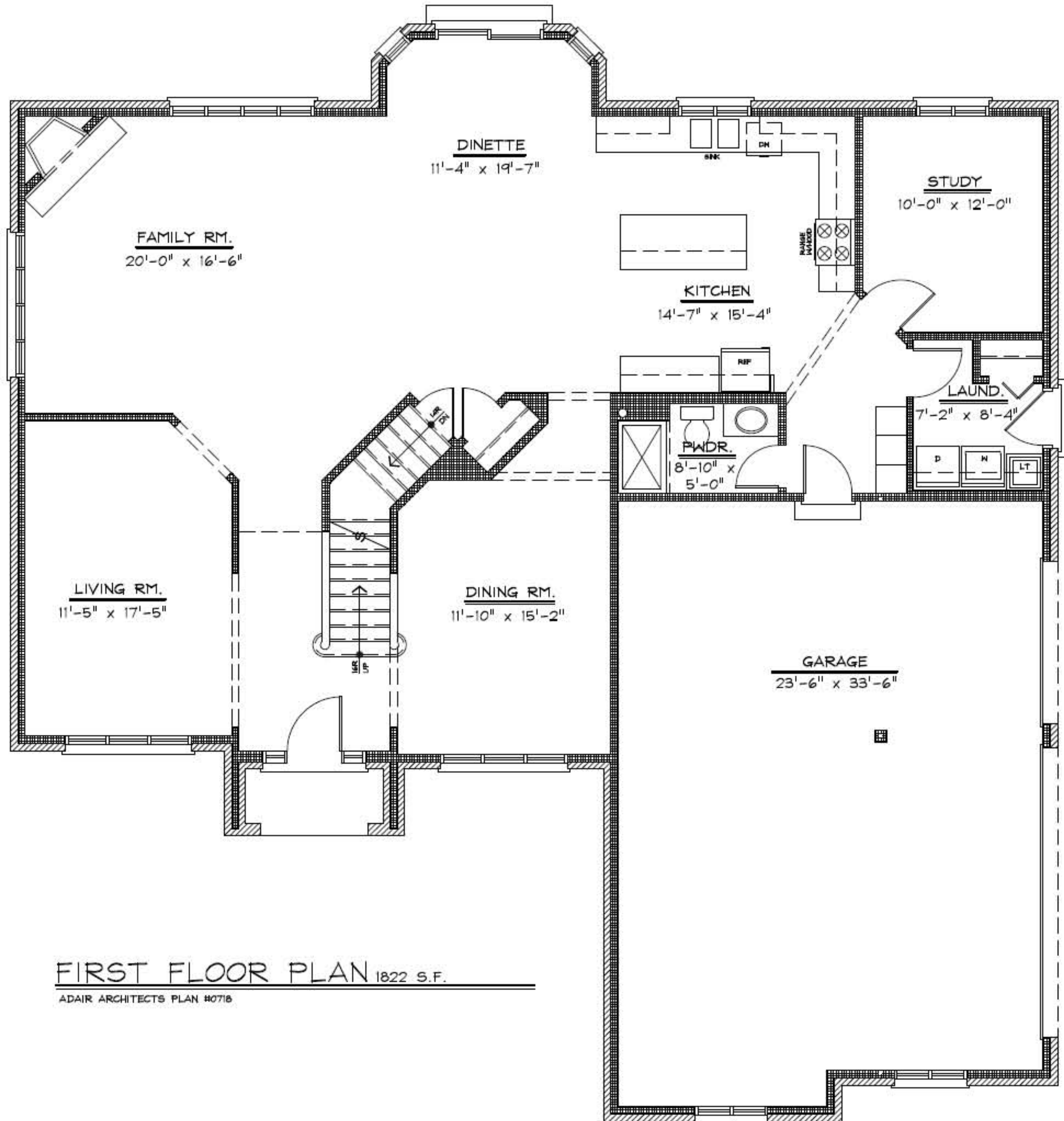
FIRST FLOOR PLAN 1822 S.F. ADAIR ARCHITECTS PLAN #0718