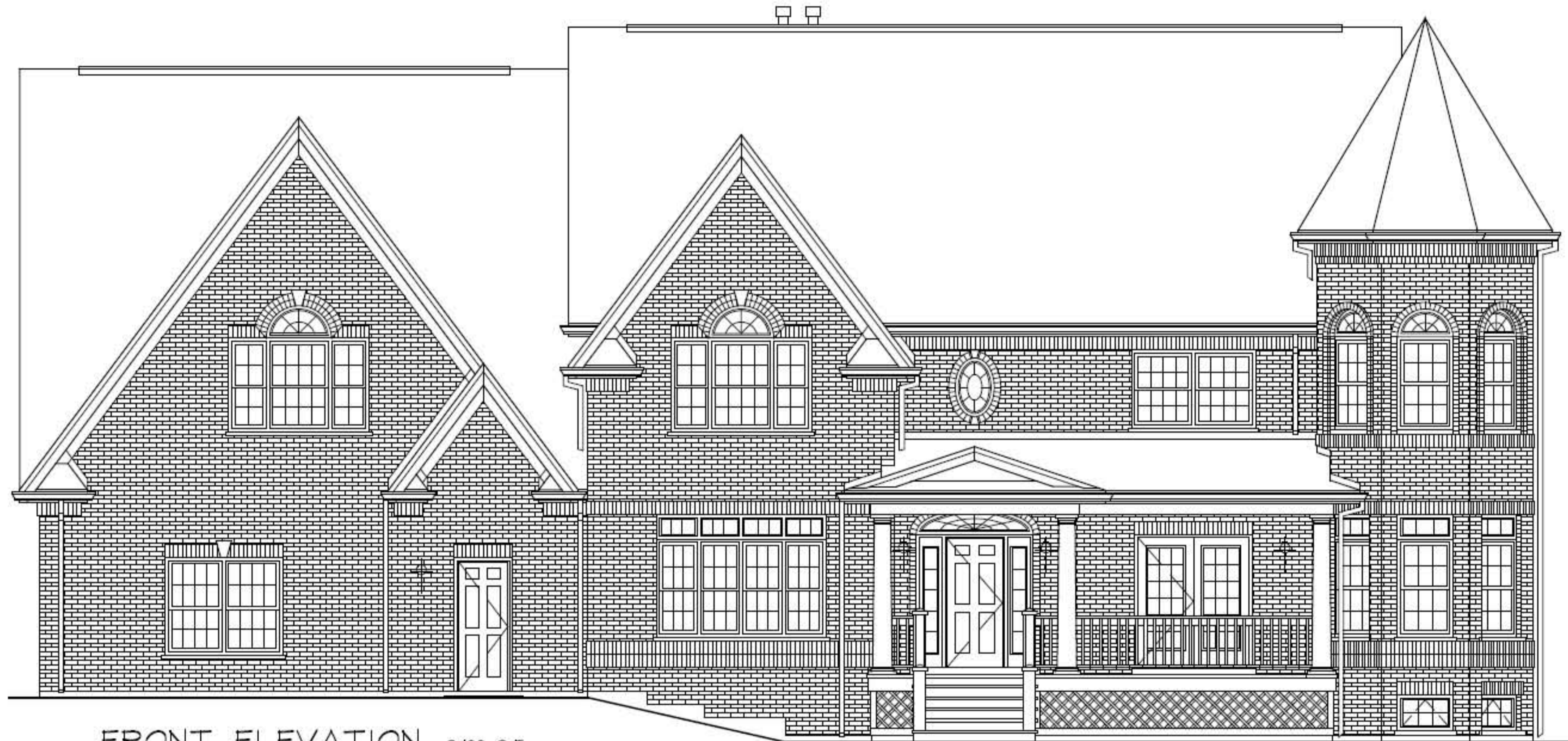
FRONT ELEVATION 3488 S.F.

19150 Wolf Rd, Suite A, Mokena, IL 60448-1081 (708) 478-7160